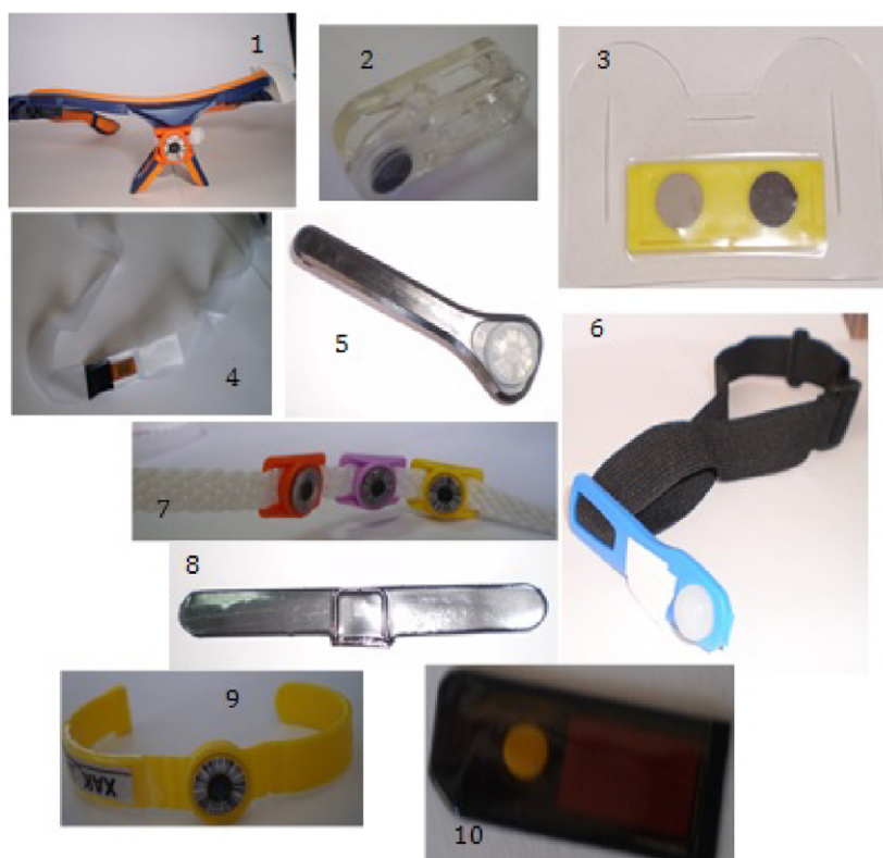
Figure 2. Some of the dosimeters that participated in the EURADOS eye lens dosimeter intercomparison.

Personal Dosimetry Service (PDS) of PHE decided to use existing resources in order to monitor the eye lens doses. The dosimeter includes a polytetrafluoroethylene (PTFE) filter of 1.5 mm thickness. The filtration is equivalent to 3.3 mm of tissue, closely matched to the definition of H_p(3) (ICRU 1993). The dosimeter element is the Harshaw EXTRAD™, as the one used in the PHE finger. The EXTRAD™ element and the PTFE filter are heat-sealed together in a polyvinyl chloride (PVC) pouch, which is part of a PVC head band. The PHE eye dosimeter was type tested and passed all the tests described in the relevant ISO standard (ISO 2000) and in the ORAMED recommendations (Bordy et al 2011b).