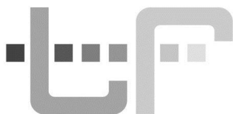
Faculty of Technology