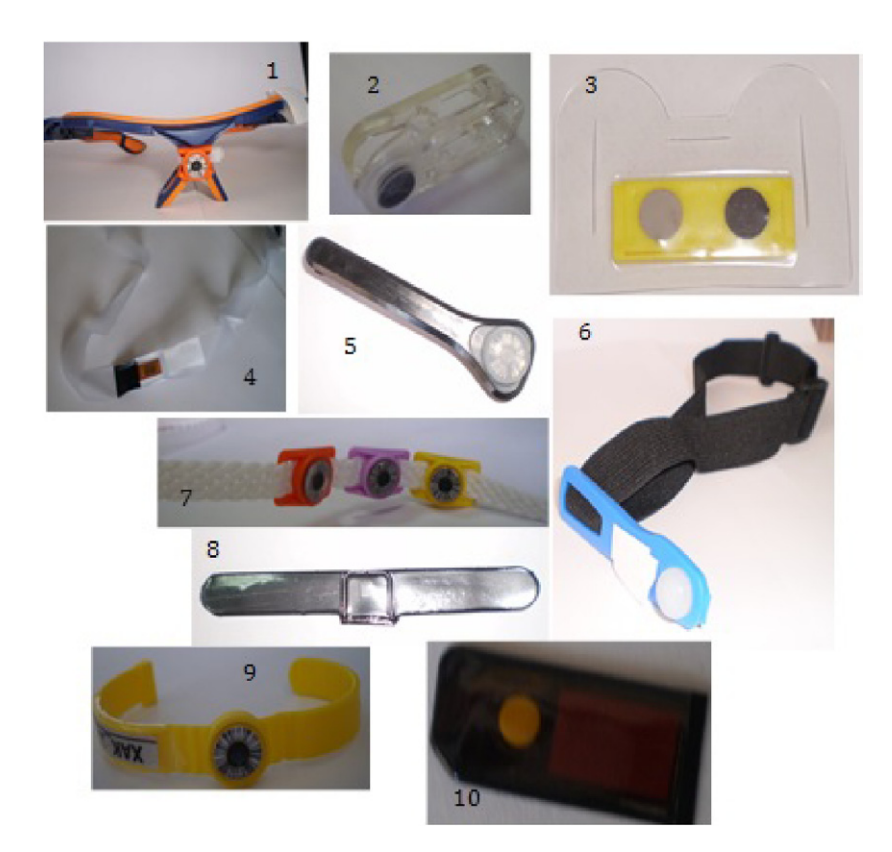
Figure 2. Some of the dosemeters that participated in the EURADOS eye lens dosemeter intercomparison.

Personal Dosimetry Service (PDS) of PHE decided to use existing resources in order to monitor the eye lens doses. The dosemeter includes a polytetrafluoroethylene (PTFE) filter of 1.5 mm thickness. The filtration is equivalent to 3.3 mm of tissue, closely matched to the definition of H_p(3) (ICRU 1993). The dosemeter element is the Harshaw EXTRAD<sup>TM</sup>, as the one used in the PHE finger. The EXTRAD<sup>TM</sup> element and the PTFE filter are heat-sealed together in a polyvinyl chloride (PVC) pouch, which is part of a PVC head band. The PHE eye dosemeter was type tested and passed all the tests described in the relevant ISO standard (ISO 2000) and in the ORAMED recommendations (Bordy et al 2011b).