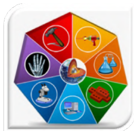
Center of Excellence "Center for Synthesis, Processing and Characterization of Materials for Application in Extreme Conditions" (CEXTREME LAB), Vinča Institute of Nuclear Sciences - National Institute of the Republic of Serbia, University of Belgrade