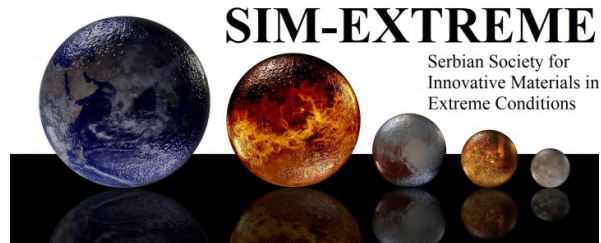
Serbian Society for Innovative Materials in Extreme Conditions (SIM-EXTREME)