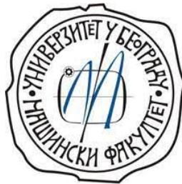
Faculty of Mechanical Engineering, University of Belgrade