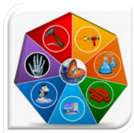
Center of Excellence "Center for Synthesis, Processing and Characterization of Materials for Application in Extreme Conditions" (CEXTREME LAB), Vinča Institute of Nuclear Sciences - National Institute of the Republic of Serbia, University of Belgrade