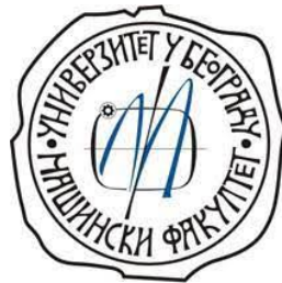
Faculty of Mechanical Engineering, University of Belgrade