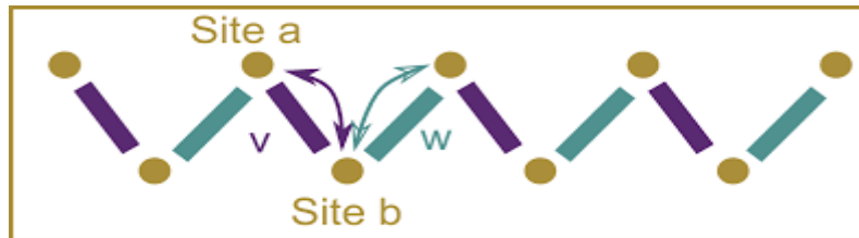
Figure 1. Schematic presentation of the bipartite SSH lattice with unit cell consisting of two sites a and b. The alternating coupling constants are denoted by v and w , respectively [1].

Abstract. One of the simplest [1] and nowadays hugely investigated models [2-5] for which topological features can be determined is the one-dimensional SSH (Su–Schrieffer–Heeger) model. In photonics, it can be realized as a waveguide array with alternating values of coupling between waveguides, Figure 1. While the linear regime has been investigated in great detail, the nonlinear regime leaves a number of questions open and is the subject of the work presented here. The light propagation through the waveguide array is mathematically modeled by the tight-binding differential-difference Schrödinger-like equation and numerically solved by the 4 th order Runge-Kutta procedure. By tuning the ratio between the coupling constants of neighboring sites in the lattice, a topological phase transition can be induced. Boundary-bulk correspondence then provides creation of an integer number of edge states and the response of the bulk via integer value of the Zak-phase. We play with adding defects and inducing the nonlinear lattice response in order to confirm existing and find and manage new topological transitions in the system. This has potential applications in realization of the basic logic gates with controlled light (classical and quantum) beams which are necessary for solving quantum computing issues.