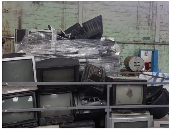
Figure 2. Collected CRT waste [10]

Considering that new CRT devices are no longer produced, the so-called Closed-loop recycling, which includes the production of new devices from old ones, is no longer possible. As a result, Open-loop recycling remained the only possible way of recycling when planning the reuse of old CRT glass. Data from the last few years from the e-waste collection and pretreatment market indicate that approximately 50,000 to 150,000 million tons of CRT glass are collected annually in the European Union (EU), and are not expected to decrease in the coming years [11]. It is believed that the amount of waste CRT glass will continue to grow until the mid-thirties of this century [12].