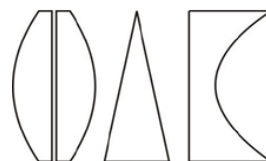
Optical Society of Serbia

Other institutions that helped the organization of this event are: Institute of Physics Belgrade, University of Belgrade ( www.ipb.ac.rs ), School of Electrical Engineering, University of Belgrade ( www.etf.bg.ac.rs ), Institute of Chemistry, Technology and Metallurgy, University of Belgrade ( www.ihtm.bg.ac.rs ), Faculty of Technical Sciences, University of Novi Sad ( www.ftn.uns.ac.rs ), Faculty of Physics, University of Belgrade ( www.ff.bg.ac.rs ), and Faculty of Biology, University of Belgrade ( www.bio.bg.ac.rs ). Joint event “Machine learning with Photonics Symposium” has been co-organized with programme partners H2020-RISE-CARDIALLY, H2020 – MULTIPLY and H2020-EID-FONTE.