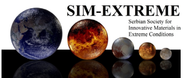
Serbian Society for Innovative Materials in Extreme Conditions (SIM-EXTREME)